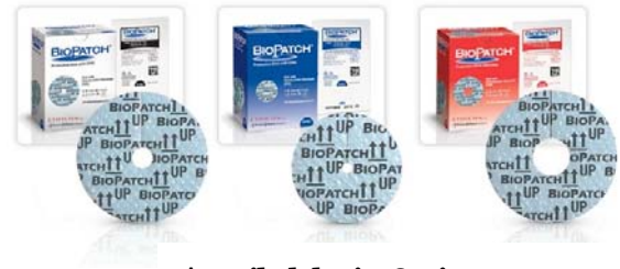
Available in 3 sizes