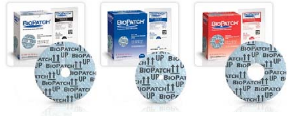
Available in 3 sizes